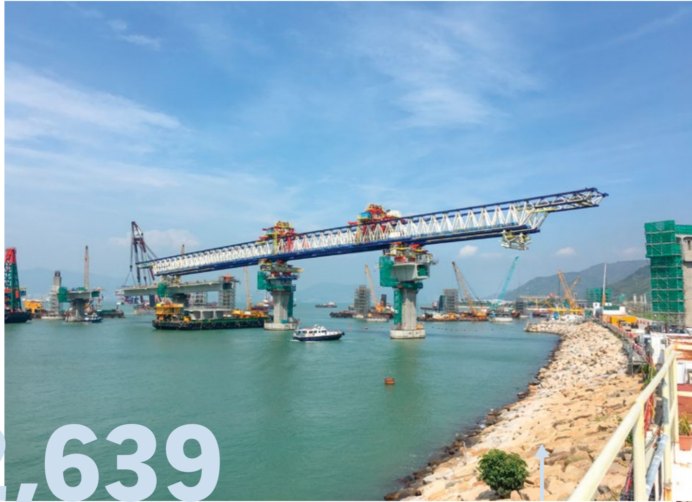
TMCLK viaduct Tuen Mun - Chek Lap Kok, Hong Kong