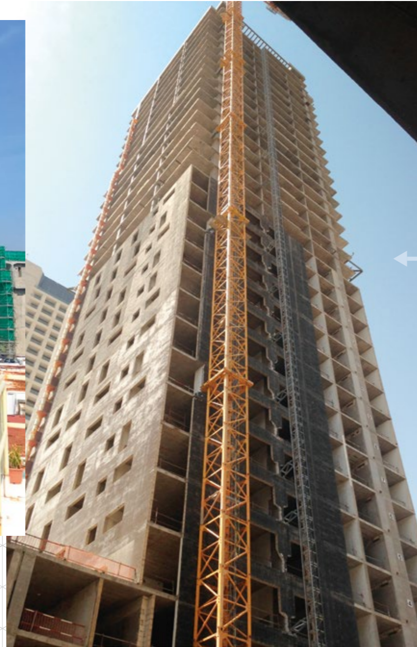
Clemenceau Medical Centre Amman, Jordan

That is the number of prefabricated segments that will be erected by Freyssinet for the viaduct that will connect Lantau Island to an artificial island, currently under construction to extend Hong Kong's International Airport. Freyssinet will also supply and install 7,000 tonnes of post-tensioning, bearings and movement joints. In 2015, Freyssinet commenced the deck erection, and on 12 January 2017, the 1,000 th segment of viaduct was completed. Specially-designed equipment was used, notably two launching gantries, each 200 metres long, and two pairs of lifting frames. Precise planning for each task was required, since the viaduct passes over roadways and railway lines, and is in a flightpath, which means restrictions on the use of marine cranes and short suspension in traffic (four hours) to allow placement. To meet the challenges of a restricted and busy site requires erecting segments in several places simultaneously, with the appropriate number of mobile, multi-skilled teams, capable of operating in different environments with various construction methods. This viaduct is one of the two major contracts being undertaken by Freyssinet in Hong Kong, along with the Liantang 3 (LT3) viaduct.